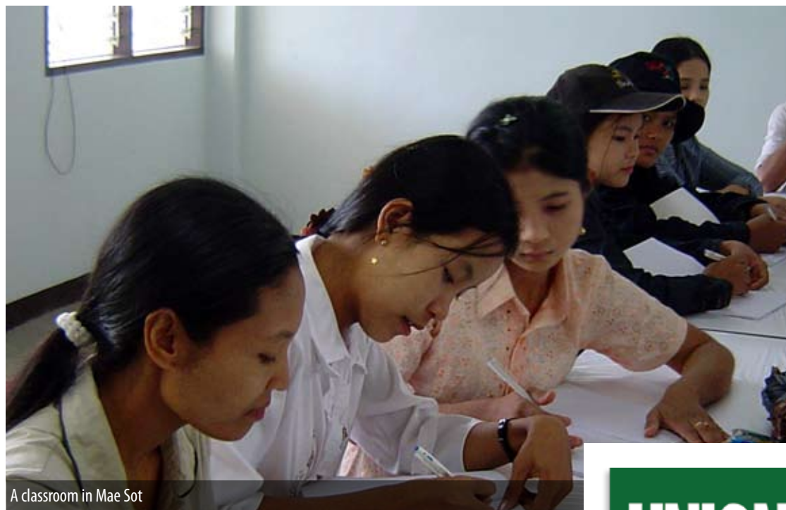
A classroom in Mae Sot

In reviewing the selection rules (for training) a decision has also been made to prioritize applicants with disabilities, are without family support in Mae Sot, or who have limited other opportunities because of low education levels. There has been a lot of interest from local employers and it is likely that this interest and support will grow. With our total funding of $NZ56,000, our project partner, the Federation of Trade Unions of Burma (FTUB) will build the complex of buildings, pay three staff, and provide food and accommodation for the staff and 350 trainees for a full year.