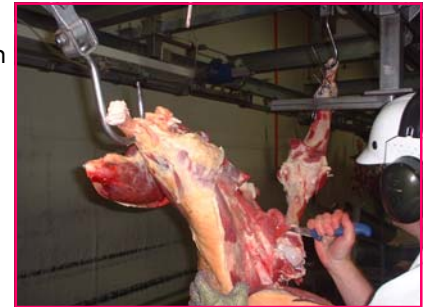
OCCUPATIONAL OVERUSE INJURIES result from repetitive cuts over long hours & minimal breaks